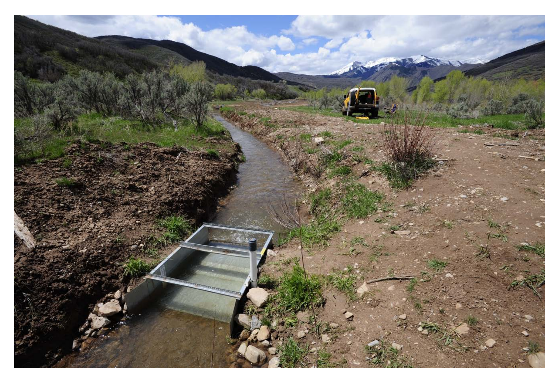
Figure 2. Photograph of ramp flume #1 with the stilling well attached.