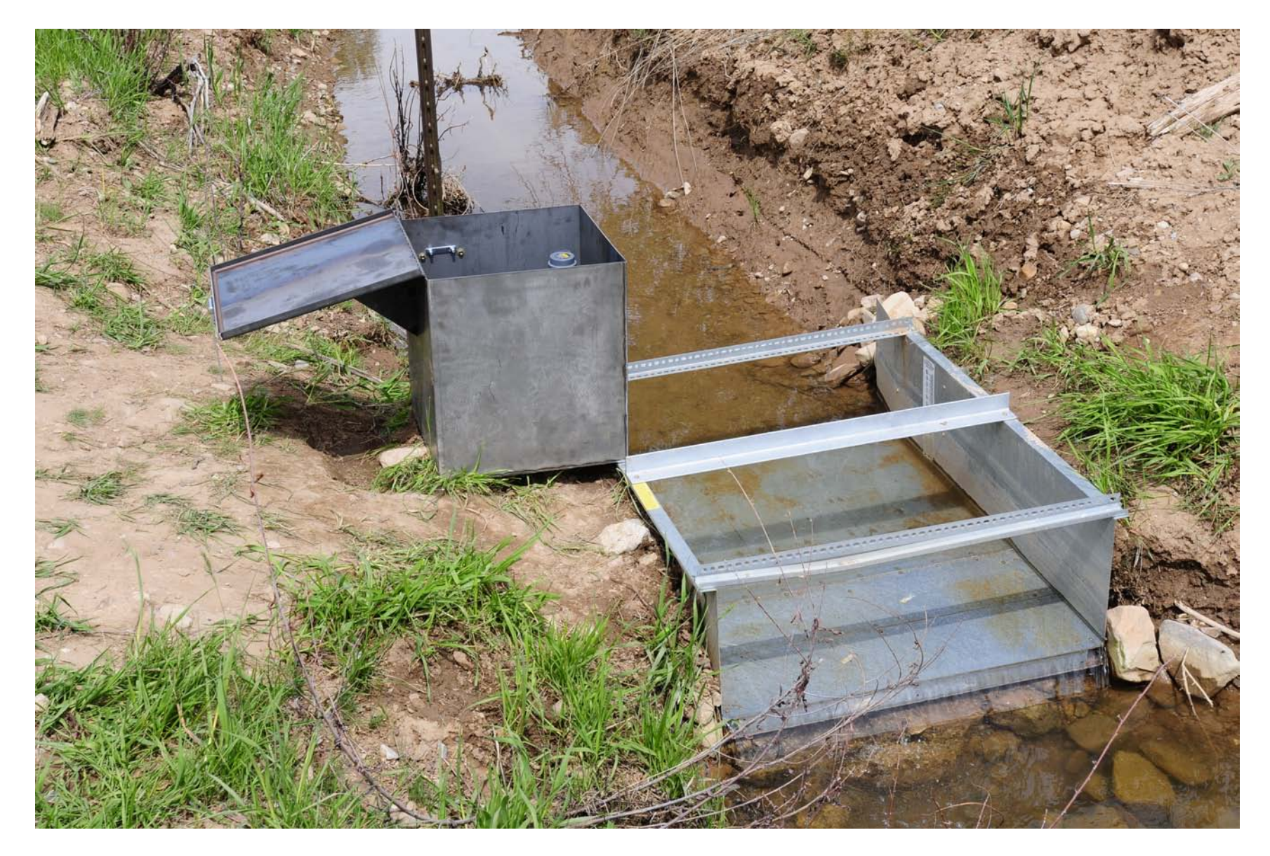
Figure 4. Lockable steel box that protects the instrumentation equipment. The lid and triangular support provide a sloping table for field computers.