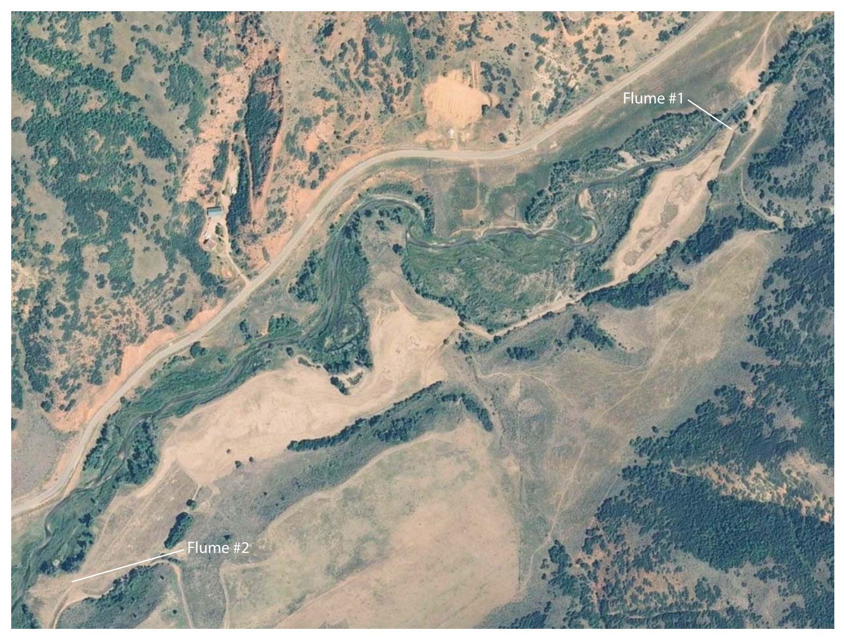
Figure 1. Aerial image taken in 2009, showing recently completed construction and location of two ramp flumes.